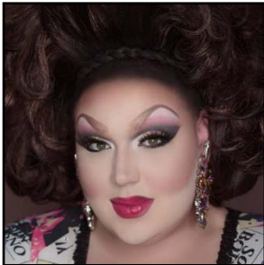
2011 Eureka O'Hara