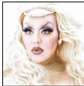
2014 Eureka O'Hara