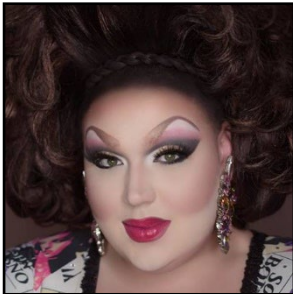
2011 & 2014 Eureka O'Hara