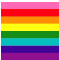
Rainbow (8 Stripe)