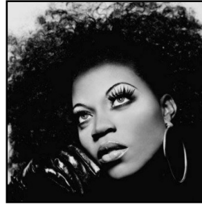
2010 Tyra Couture