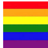
Rainbow (6 Stripe)