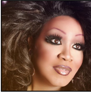
2009 Coco Couture