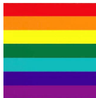
Rainbow (7 Stripe)